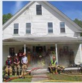
Townshend Volunteer Fire Department